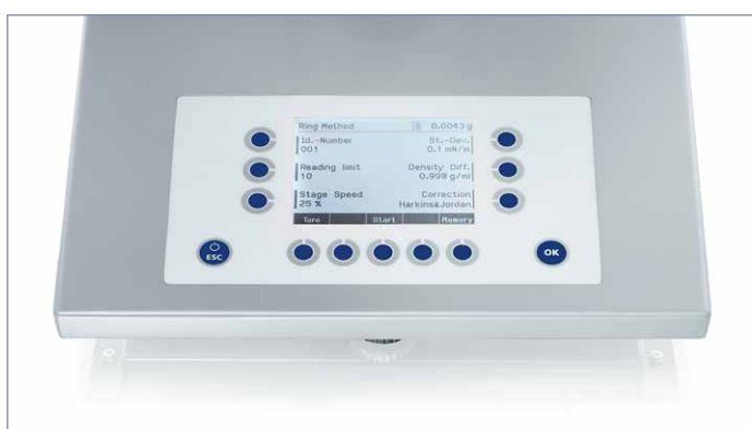
Preset parameters for computer-independent measurements

The quick and simple manual operation of the sample stage and the large, illuminated sample chamber allow for swift positioning of the sample vessel. Then one of the prepared measurement programs moves the motorized sample stage and records the measurement results. The speed and other parameters can be easily optimized for the specific range of values of your particular application.