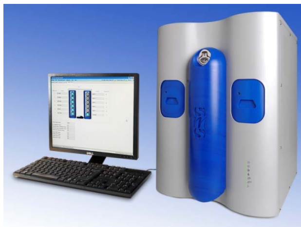
iGC Surface Energy Analyser

The principle of iGC is the reverse of conventional gas chromatography (GC). A chromatography column is uniformly packed with the solid material of interest, typically a powder, fibre or film. A vapour pulse or gas is then injected down the column at a fixed carrier gas flow rate. The time taken for the pulse or gas front to elute down the column is measured by a detector.